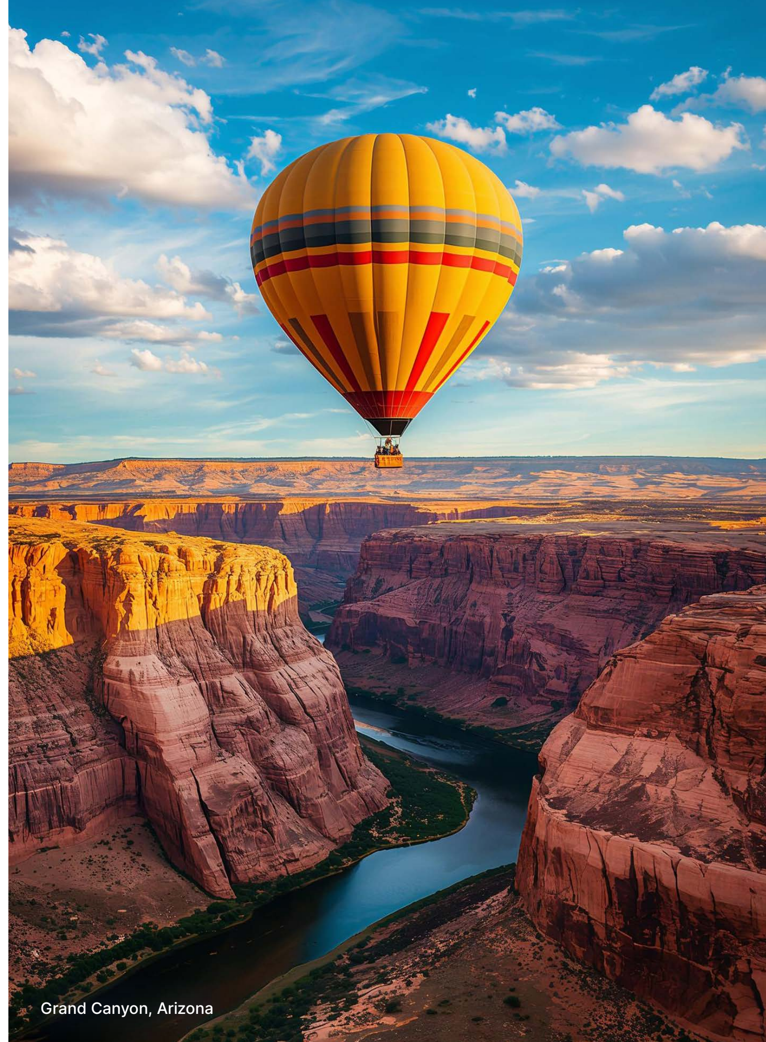
Grand Canyon, Arizona